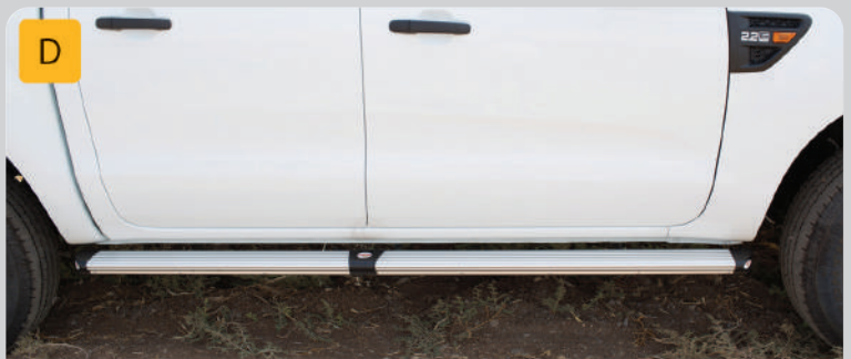
Silver Side Step Protector