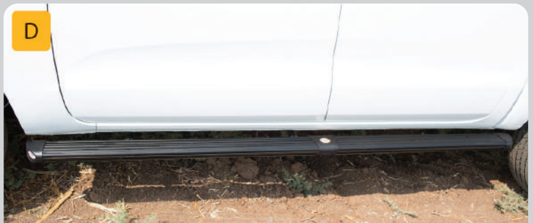
Black Side Step Protector