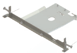
Transfer Skid Plate