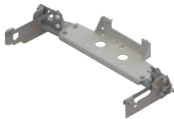
Hidden Winch Plate