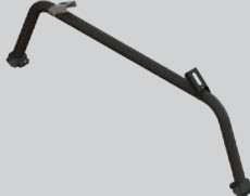
Tie Down Rack (installation with utility rack)