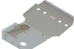
Front Skid Plate