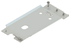
Gear Skid Plate