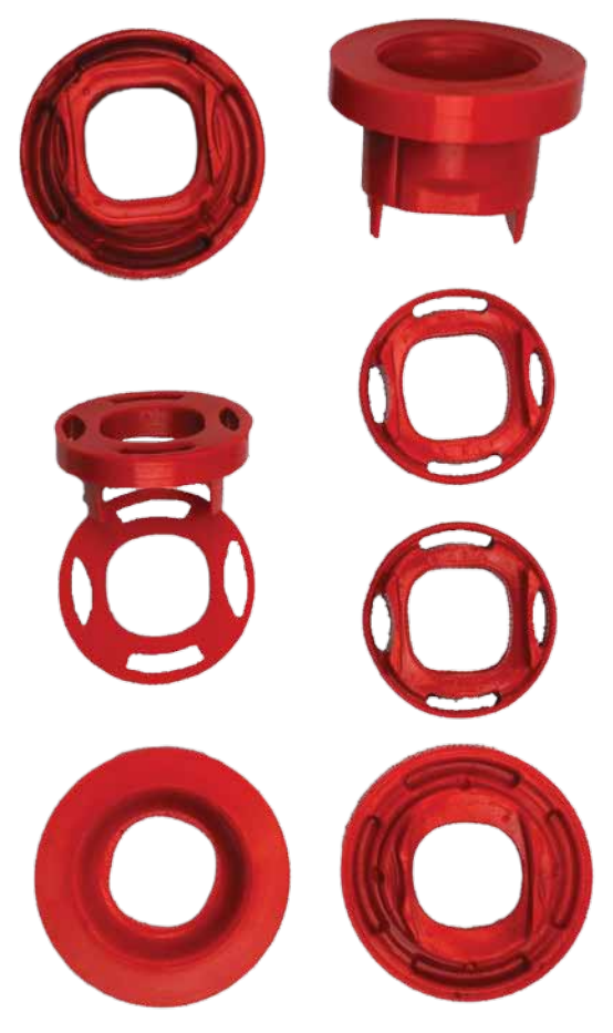
"The subframe inserts are hands-down the best bang-for-the-buck first modification any VE Commodore owner should make. It makes it a better car."