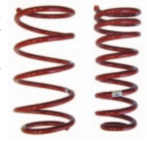
7855 & 7854

Pedders Suspension has a full set of raised height country pack coils for those VE Commodores that need just little extra ground clearance for country driving. When towing a caravan/boat or trailer the rear of the vehicle will squat noticeably. The Pedders Suspension 7955 heavy duty towing coils are specifically designed to enhance the vehicles load carrying characteristics. They are also particularly suitable for reps who are often carrying loads by trailer or in the boot of the vehicle.