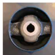
89mm OD bushing On centre tube USE EP1188

EP1188 - Differential rear mount Falcon BF/ FG & SX/SY Territory 89mm outside diameter