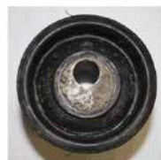
75mm OD bushing Offset centre tube USE EP1187