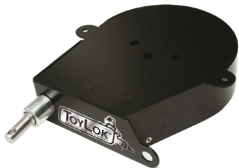
HR-TL1020 - 5.5m Steel Case