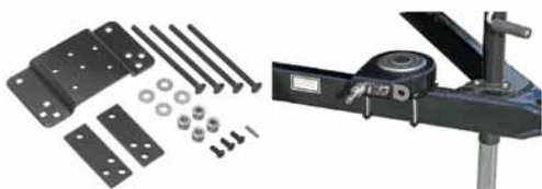
HR-TL007 - Trailer Mount Kit