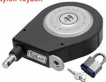
HR-TL2021 - 4.6m Nylon Case