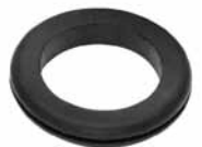
HR-TL010 - Toolbox Fitment Kit