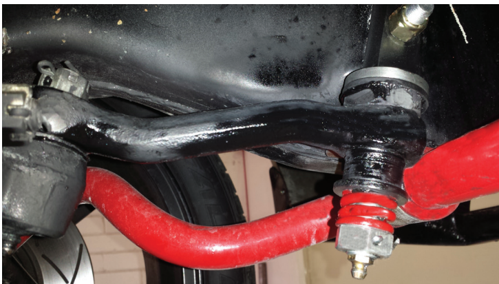
As fitted to the Pedders Mad Monaro

Note: 402119 is both suitable for aftermarket Idler arms or with 'minor machining' for OE Idler Arms.