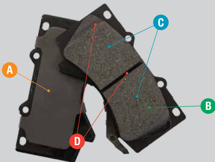
4WD Vehicle Pedders Ceramic Brake Pads