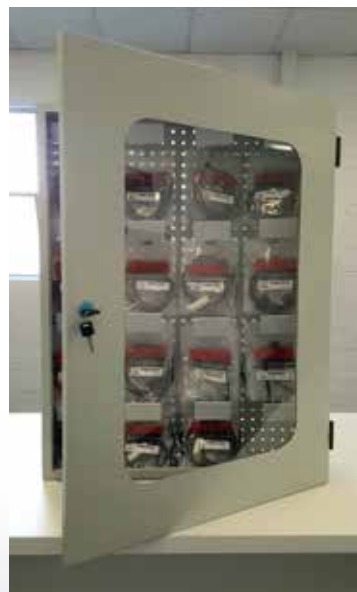
Pedders Brake Sensor Parts Cabinet Available from your local Pedders Outlet

Pedders brake sensors offer a reliable, quality replacement part to suit most European makes and models.