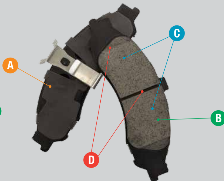
Passenger Vehicle Pedders Ceramic Brake Pads