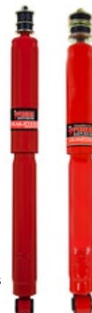
TRAKRYDER, Foam Cell Shock Absorbers