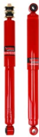
TRAKRYDER Gas Pressurised Shock Absorbers

Also included in our range is our premium Foam Cell shock absorbers which are ideal for constant or heavy load carrying and towing applications.