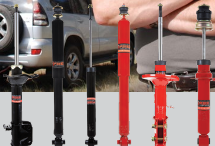
Pedders Shock Absorbers