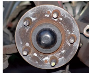
Dirty Hub Face