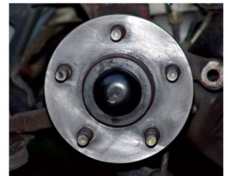
Clean Hub Face