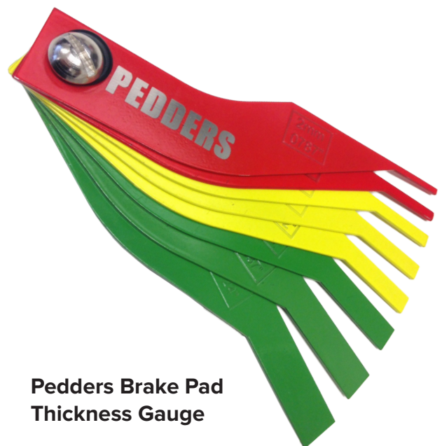
Pedders Brake Pad Thickness Gauge

It has been known that mistakes have been made when a brake check has been performed. The report says all is good, pads are OK. A week later the customer comes back with a brake noise, Why? Because when a car is fitted with floating calipers (which is the majority today), the inside pad is sometimes hard to see, so the technician assumed the inside pad would have the same wear rate as the outside pad, which was really good. This was not the case and the inside pad had greater wear as this is the first reaction pad, it comes into contact with the rotor first and therefore has a tendency to wear quicker. Pull the wheels off and have a good look.